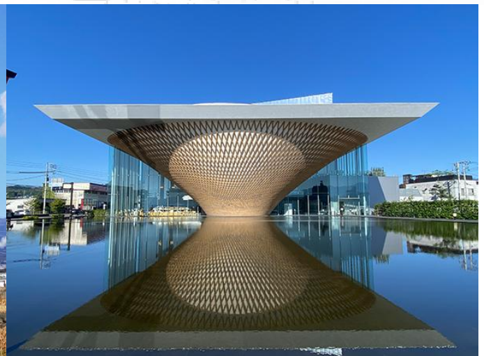
Mt. Fuji World Heritage Centre, Shizuoka