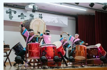
Traditional Japanese Taiko Show