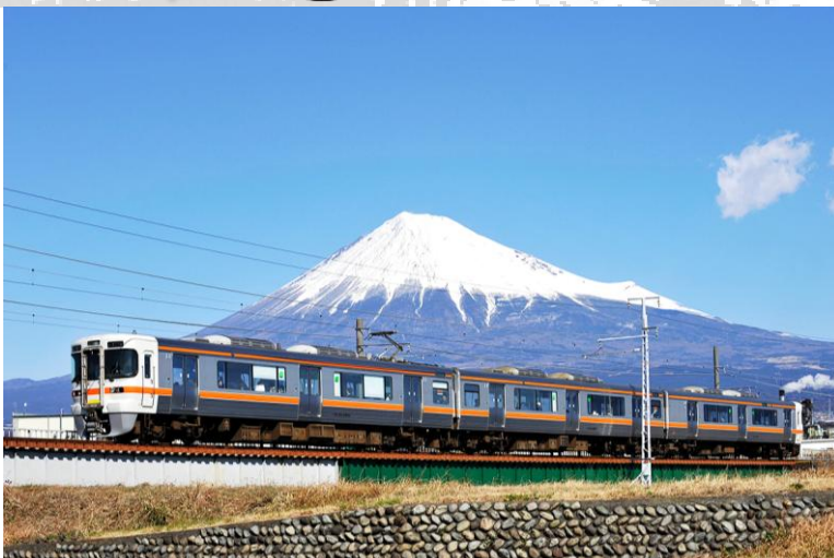
Hokusai Special Train & Shinkansen